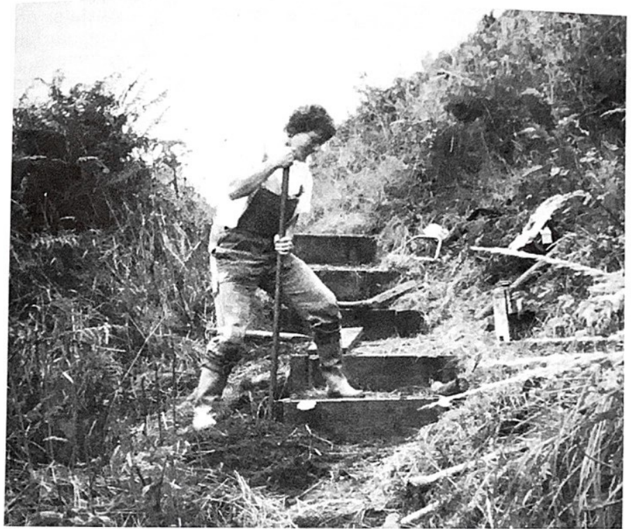
An International Volunteer at work in Ynys Môn.

Continuing to build on the expansion of its work, in 1987 International Youth Service organised 26 international voluntary projects in Wales and has expanded its overseas work and contacts.