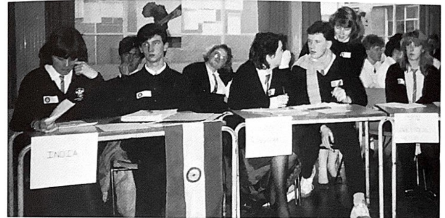
"Members of the Indian, UK and Soviet Delegations" solving problems of the Middle East at the Gwent Sixth Form Model UN Assembly.